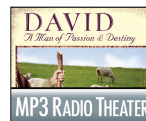
David: A Man of Passion & Destiny, Part 1 MP3 Radio Theater by Insight for Living download only

For related resources, please call: USA 1-800-772-8888 AUSTRALIA 1 300 467 444 CANADA 1-800-663-7639 UK 0800 915 9364 Or visit insight.org or insightworld.org