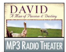
David: A Man of Passion & Destiny, Part 1 MP3 Radio Theater by Insight for Living download only

For related resources, please call: USA 1-800-772-8888 AUSTRALIA 1 300 467 444 CANADA 1-800-663-7639 UK 0800 915 9364 Or visit insight.org or insightworld.org