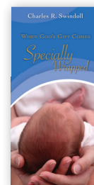
When God's Gift Comes Specially Wrapped by Charles R. Swindoll booklet